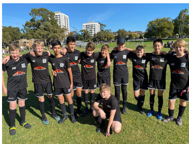
Sydney Bushfire Consultants sponsored the 13A boys in 2020 and 2021.